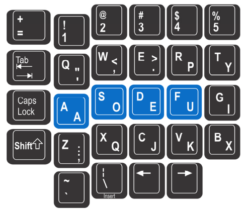
Fig 3. Dual legended Qwerty/Dvorak keycap layout. Use with on-board Dvorak feature (Program+F4)

The Advantage2 also comes preloaded with an onboard Dvorak layout. Dual-legended QWERTY-Dvorak keycaps are standard on the KB600QD, but they can also be purchased separately and installed on any Advantage2 keyboard.